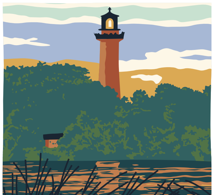
PROTECT THE NEXT 250