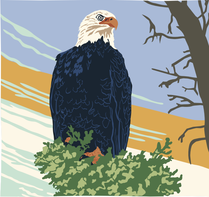
PROTECT THE WILDLIFE