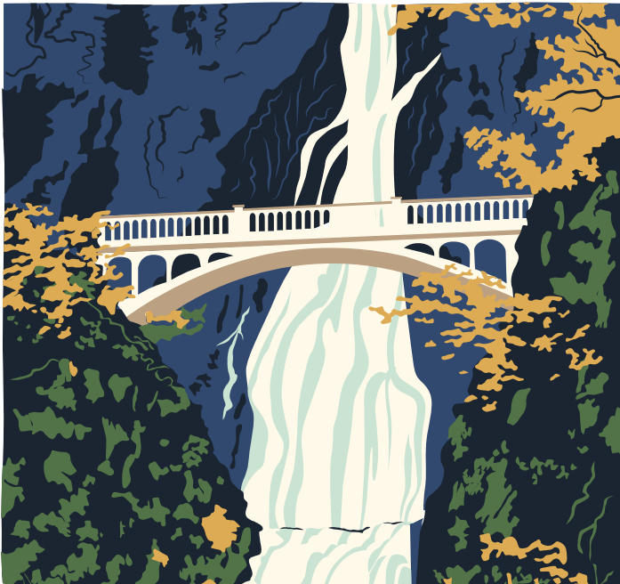
PROTECT THE EXPERIENCE